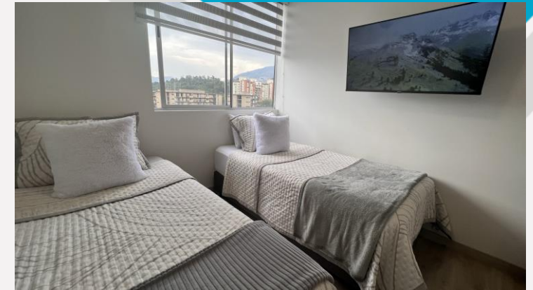
Auxiliary Bedroom 2