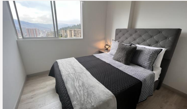
Auxiliary Bedroom 1