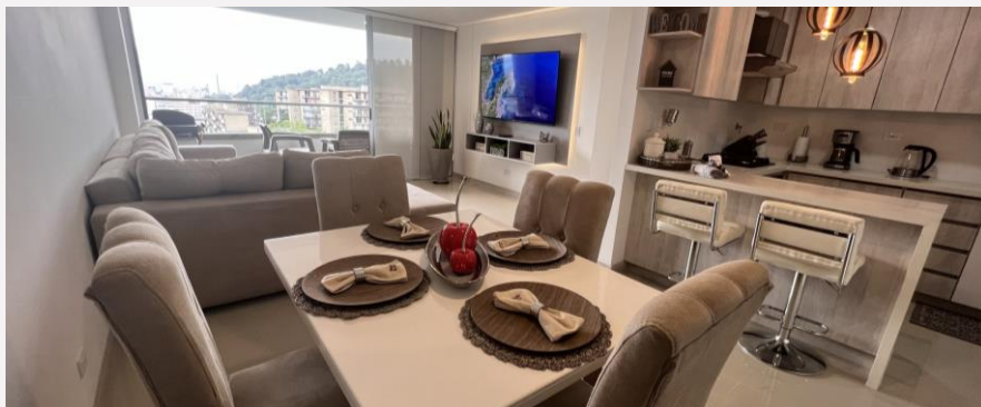
Living Room & Dining Room