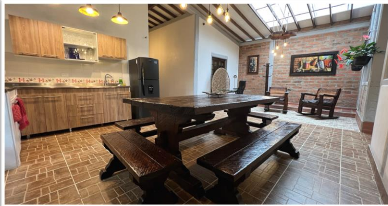
Dinning Room & Kitchen