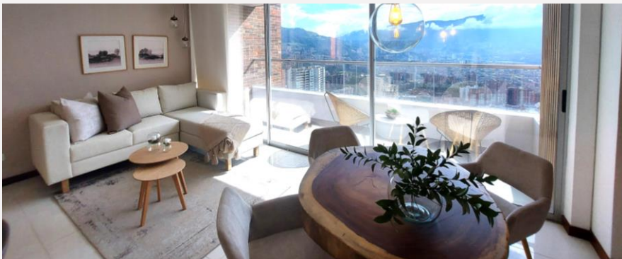
Living & Dining Room