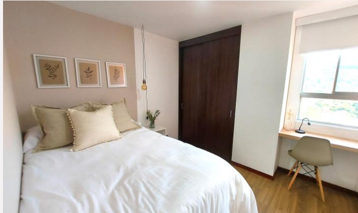
2 nd Bedroom