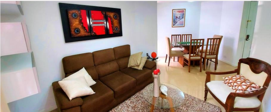
Living Room & Dining Room