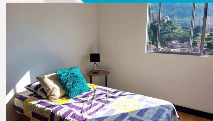
Auxiliary Bedroom 2