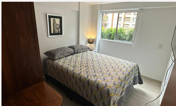
Auxiliary Bedroom 1